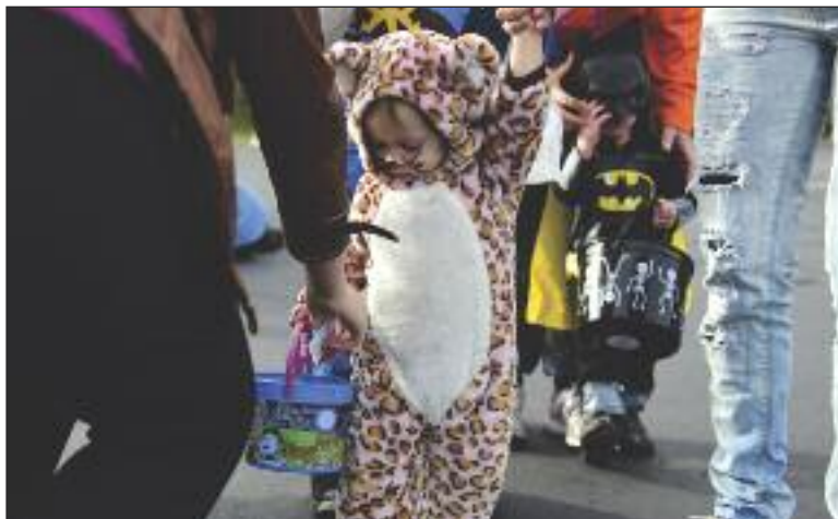
AMY HIGGINS / ELYRIA SCHOOLS

At Elyria High School, students will decorate their vehicles and park in an easy-to-navigate